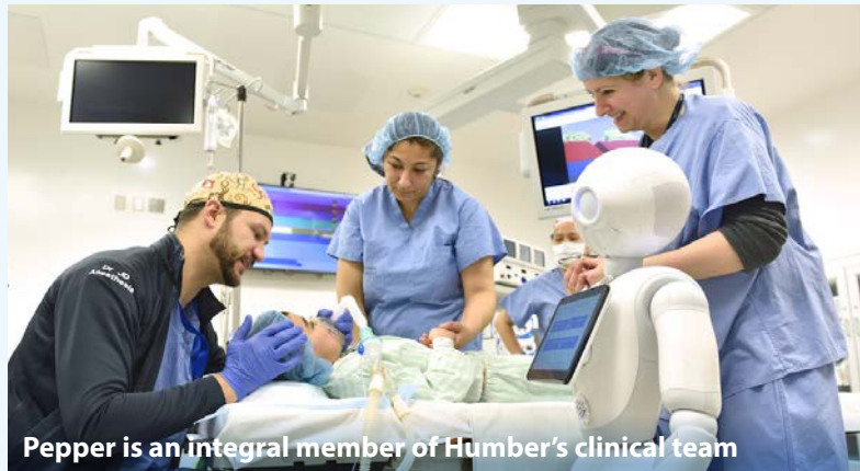
Pepper is an integral member of Humber's clinical team

It is common at Humber to hear staff and visitors say, 'Meet you at Pepper!'