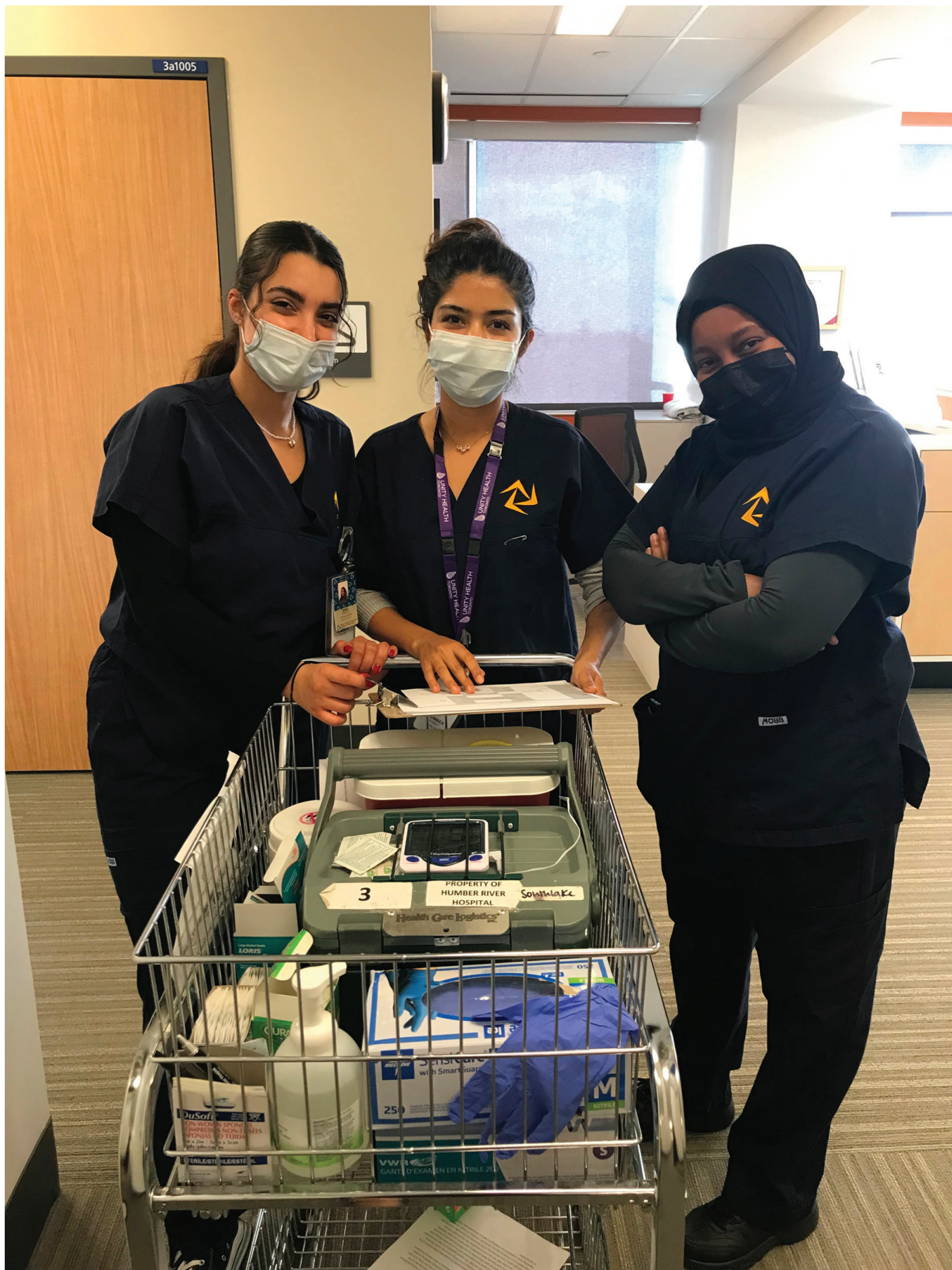
Figures 2a, 2b. Nursing students with the roving cart.