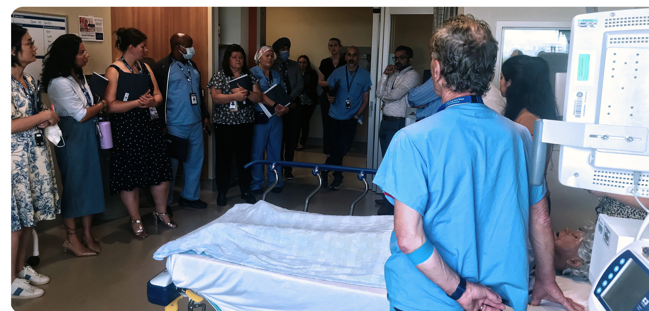
Figure 2. Tabletop & Mock Simulation Walkabout with the Intensive Care Unit and Surgical Teams.