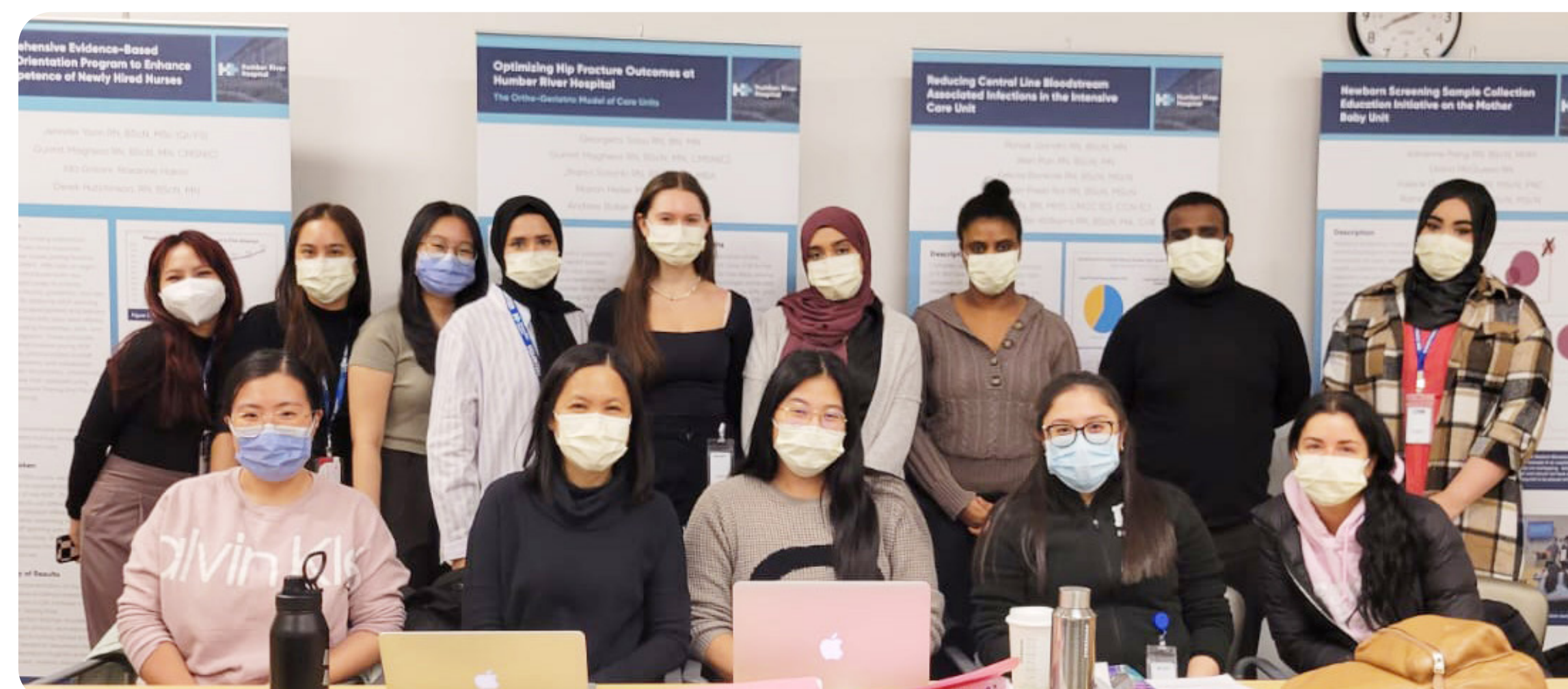
Figure 1. The student cohort from York University, Centennial College, and Toronto Metropolitan University (January – April 2023).

In preparation for the scheduled accreditation survey by Accreditation Canada in October 2023, Humber River Health (HRH) launched a ROP Audit Program in 2022. In January 2023, the scale of the program was expanded to audit ROP compliance among clinical and non-clinical staff. To facilitate this implementation, the Quality and Patient Safety team provided placement opportunities to 18 undergraduate students from various university healthcare programs. The students completed audits among HRH's staff members for three months. HRH's Accreditation preparation process was a collaborative effort between the student cohort, frontline staff, and the senior leadership team.