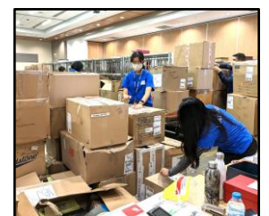
Co-op students at work