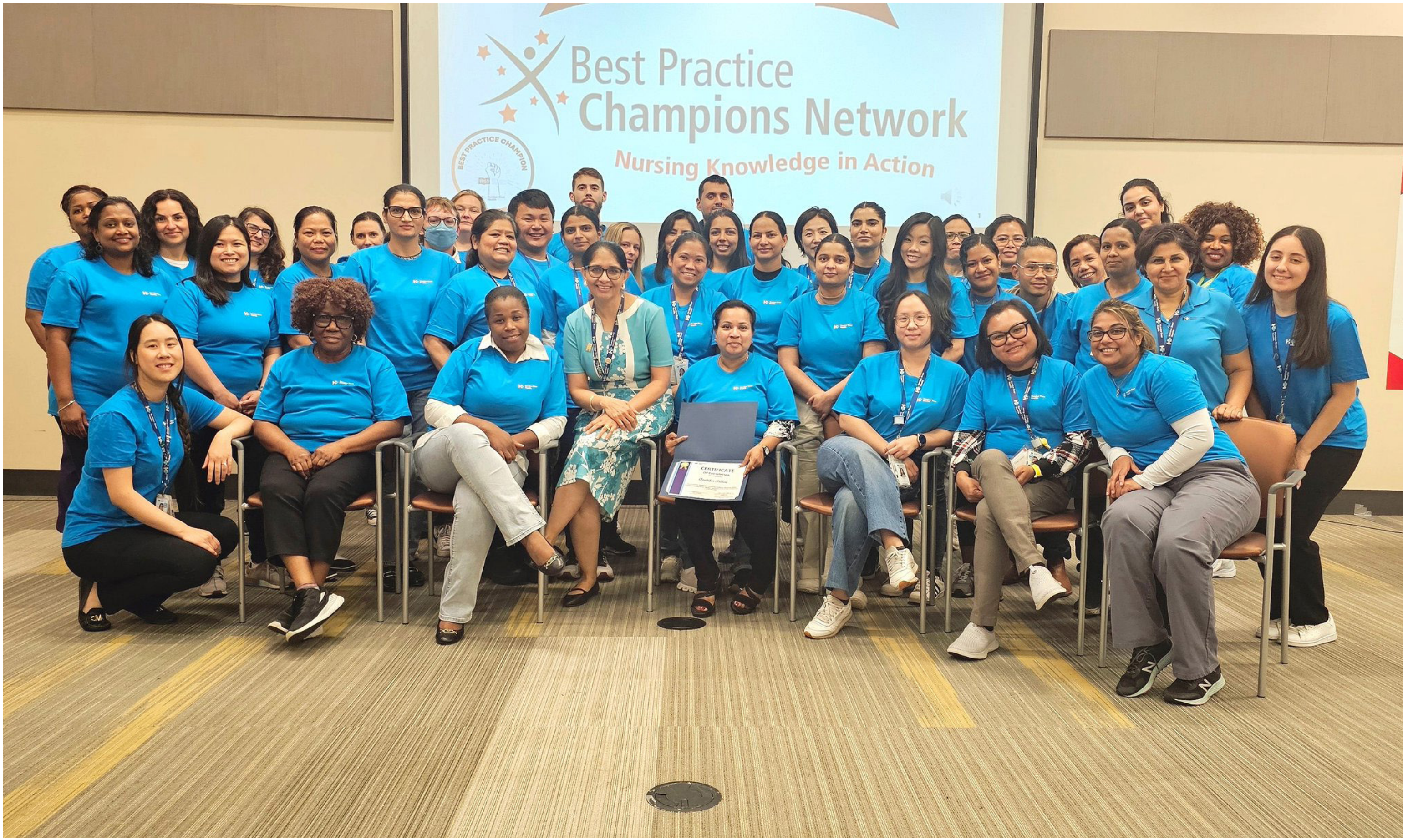
Figure 5. Attendees of the Interprofessional Team Best Practice Champion Open-House – 2024.