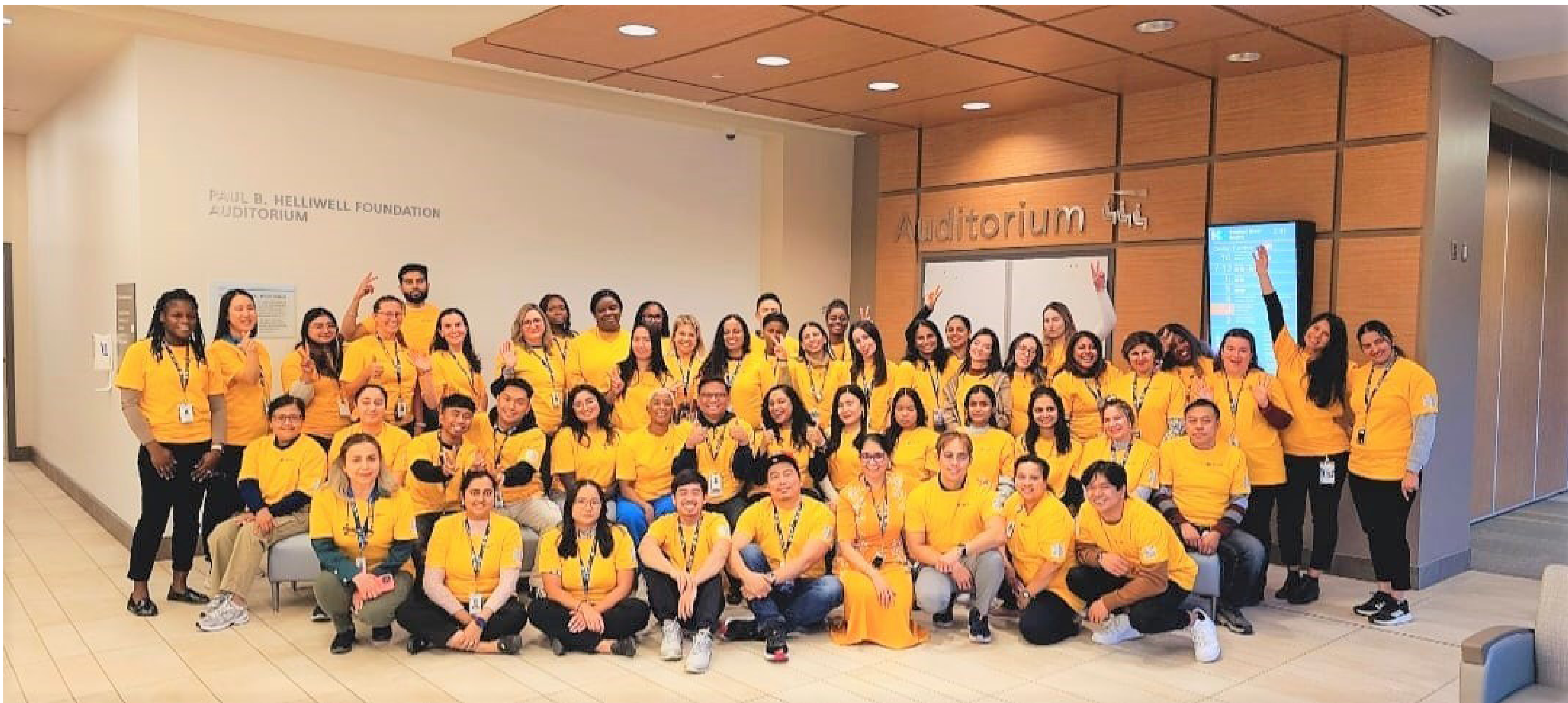
Figure 2. Attendees of the Interprofessional Team Best Practice Champion Open-House – 2023.