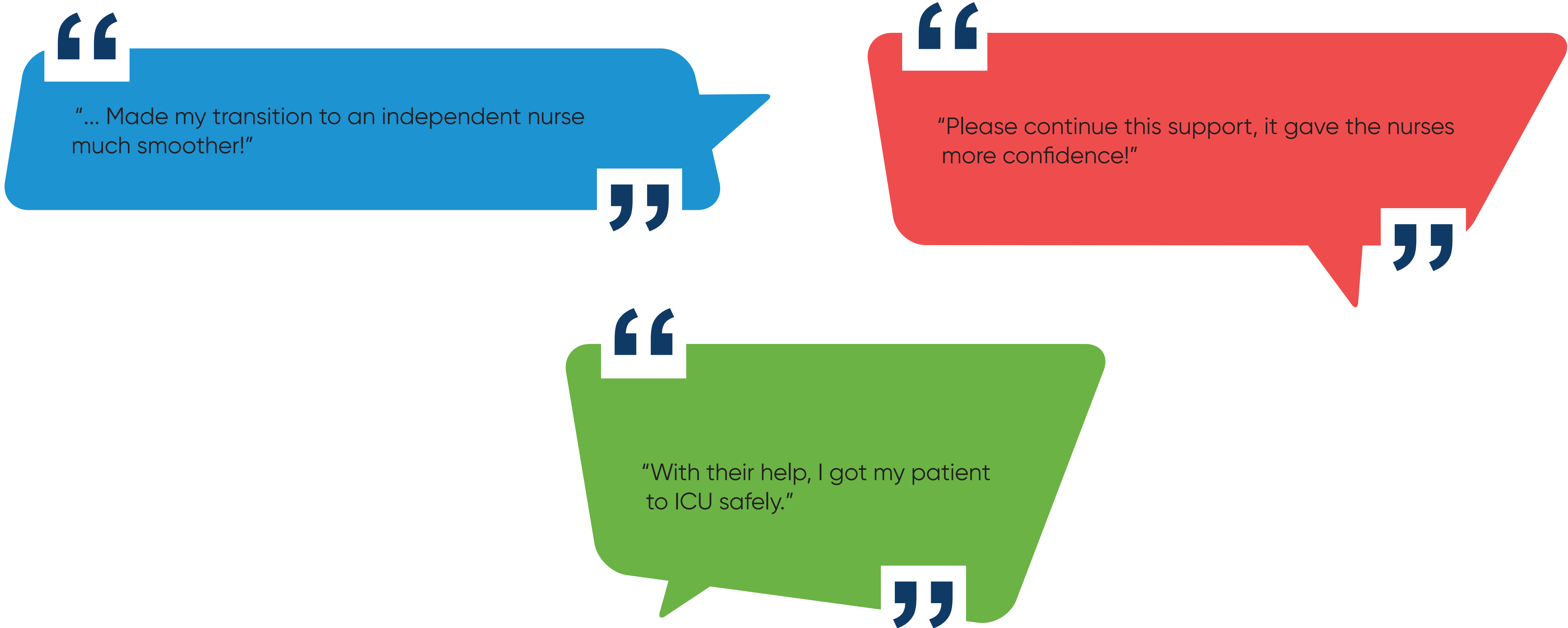
Figure 3. Positive feedback from nursing staff on 9th floor regarding the clinical scholar.

The 9th floor, an Inpatient Medicine Unit, at HRH is an area that noted positive impacts since introducing the Clinical Scholar role.