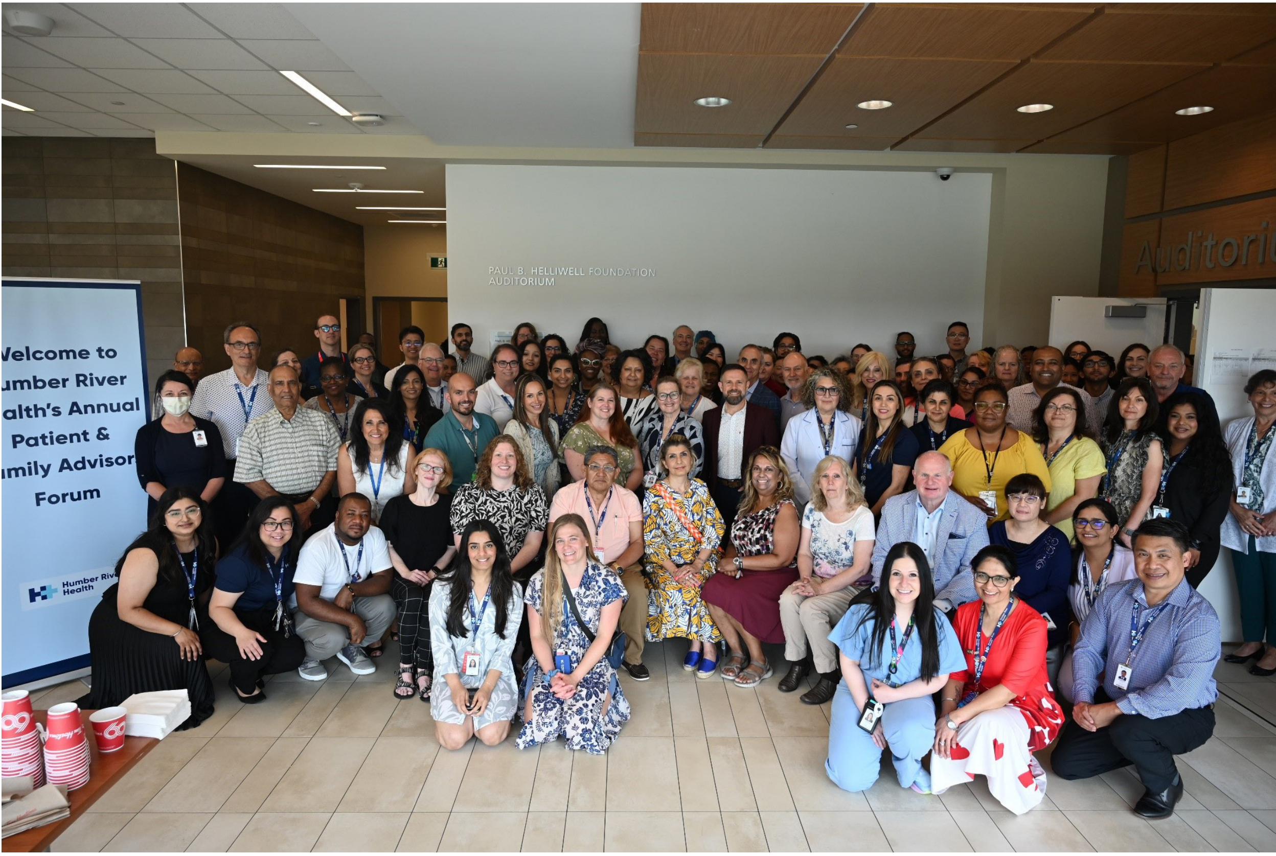
Figure 3. Humber River Health's (HRH) 1st Annual Patient and Family Advisors' Forum attendees included staff, physicians, volunteers, and Patient and Family Advisors involved in Patient and Family Advisory Councils, Reinventing Patient Care Councils, committees, and groups across the organization.