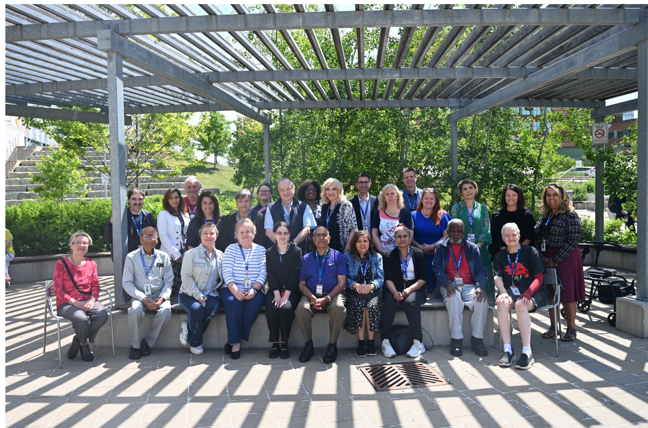
Figure 2. PFA picture from Forum Day.