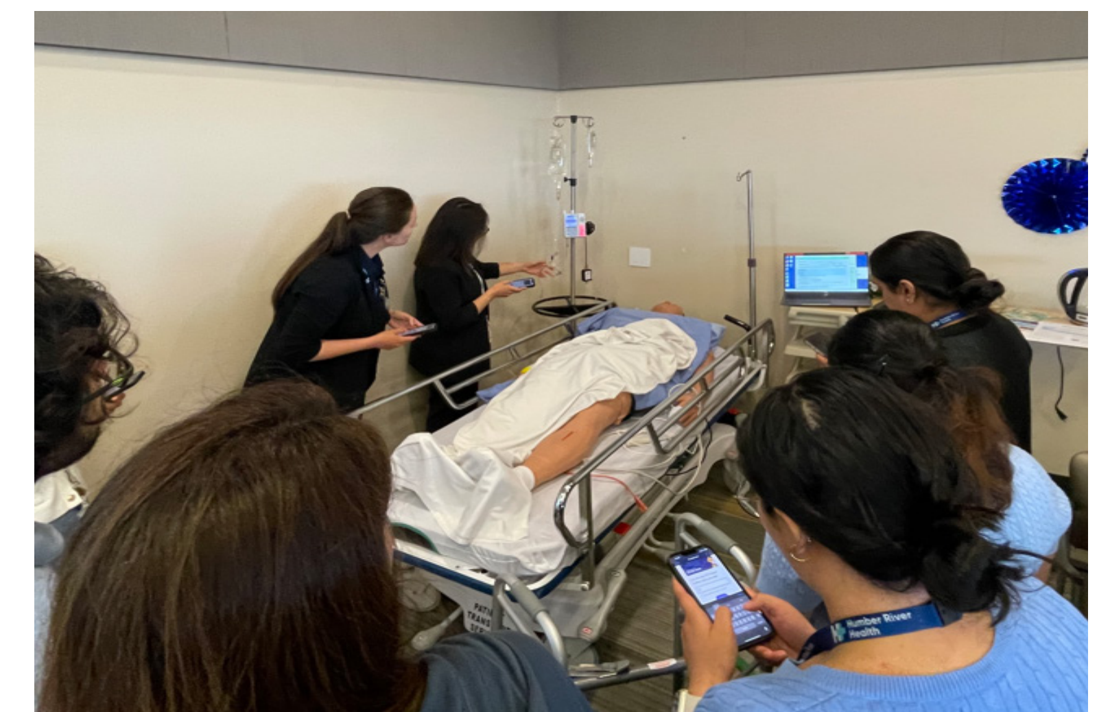
Figure 3. Participants engaging in the Healthcare Escape Room activity.