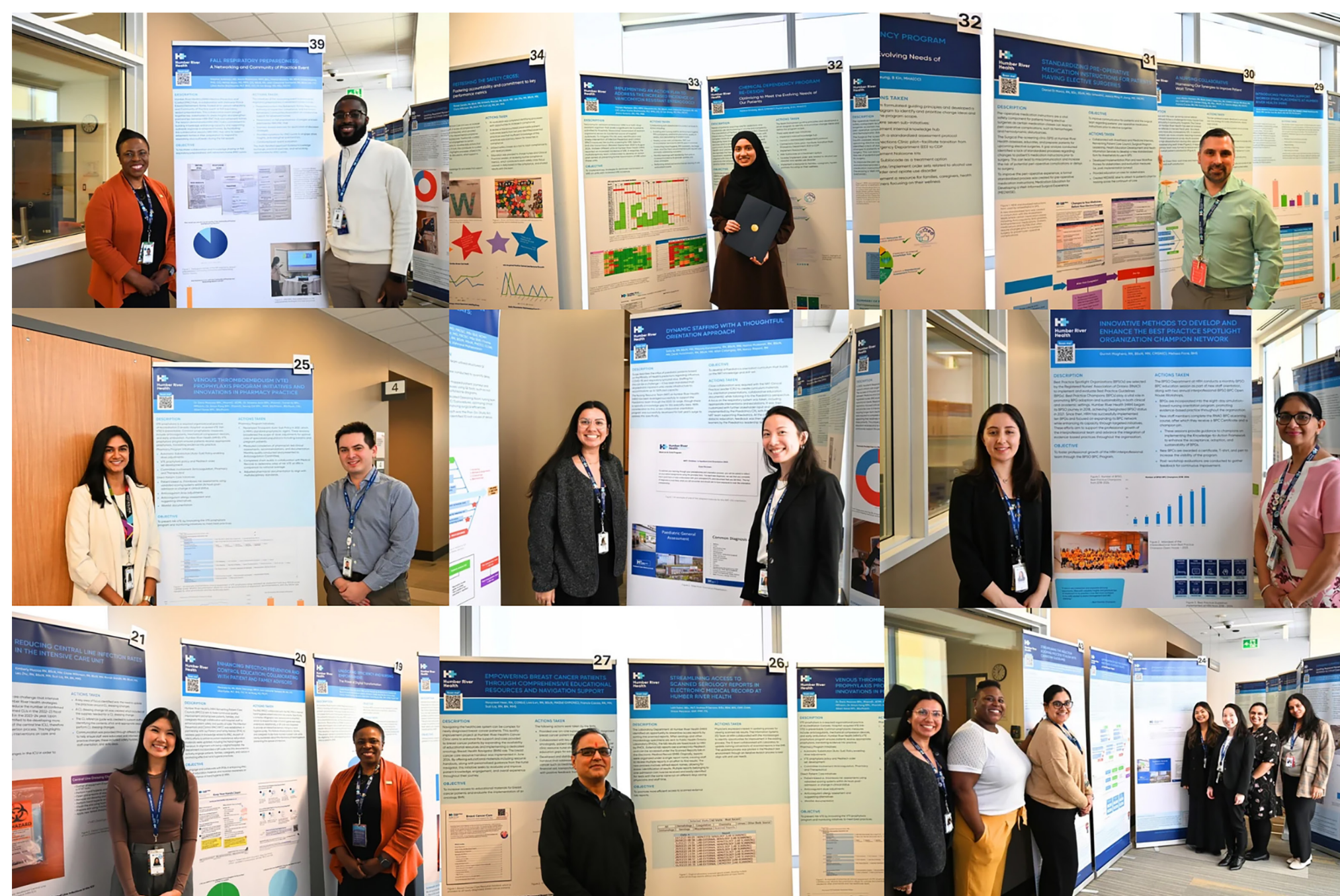
Figure 1. HRH clinical teams showcasing their quality improvement projects at the "2025 Scholarly Practice Day".